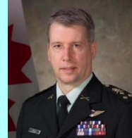
LGen (Retd) Andrew Leslie